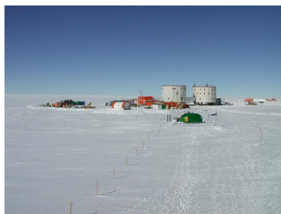
Concordia Station

Further general details on Concordia Station can be found at http://www.concordiabase.eu/